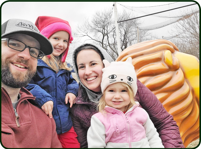
The Dunlap family in Manhattan