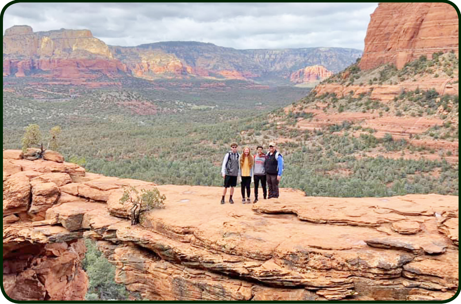
The Reeds enjoyed sunny Arizona.