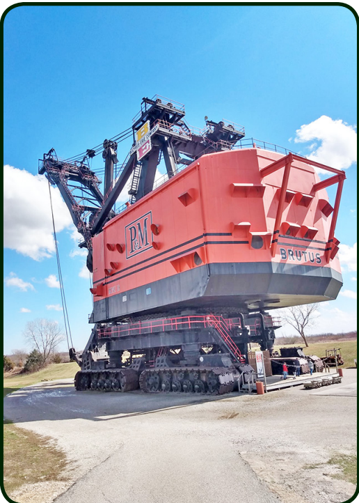
Prim Family visited Big Brutus